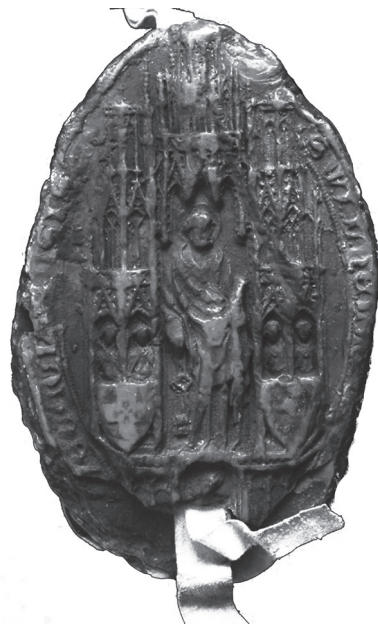
Picture 2. The imprint of the Bishop's seal of Bishop Vilmos