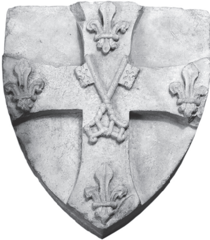
Picture 1. The stone of Bishop Vilmos of Koppenbach's coat of arms

they obtained buildings for their own purposes, and in the 15 th century they raised new buildings suitable specifically for education and administrative duties. The building complexes that were representative of the whole university were built in the 16 th century. In the beginning, some lectures were held in the open air, but most took place in rented rooms. In many cases they were held at the lecturers' flats in private houses, or in rooms of such public places that were offered by monasteries, cathedral chapters or the town itself. The events that attracted a great audience were organized in public squares, while the conventions, exams, the inauguration of the rectors and the major holiday celebrations were held in churches and monasteries. 89