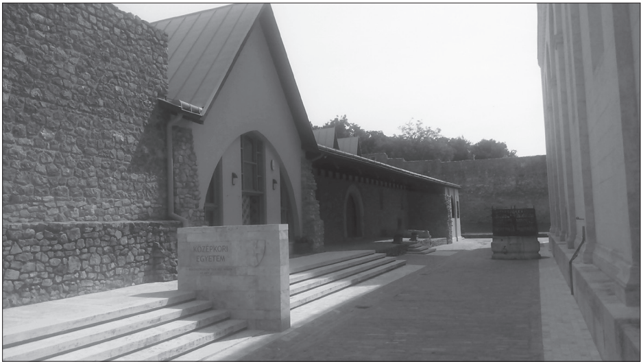
Picture 3. The building of the so-called medieval university of Pécs

west of the cathedral, the Golden Chapel of Mary was the episcopal chapel and burial place. It is undisputable that the erection and reconstruction of the building excavated by Mária Sándor must be connected to Bishop Vilmos due to the above described armorial stone. However, in the absence of further direct data it is problematic to attach a function to a building based on a coat of arms. Namely, it was a common practice that the builder had his coat of arms placed on the buildings he had built. 97 For this reason, it only follows that during the episcopacy of Vilmos of Koppenbach significant construction was carried out on the building.